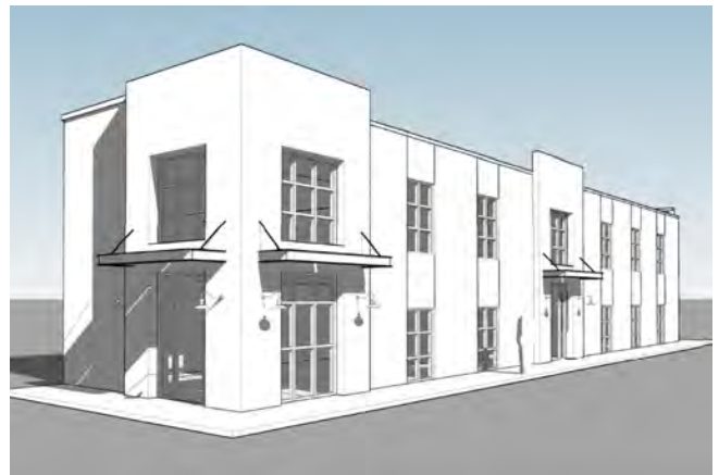
proposed exterior renovation